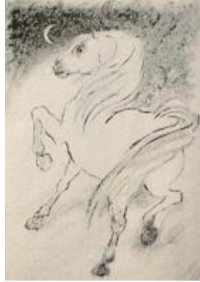
The White Stallion by Lola